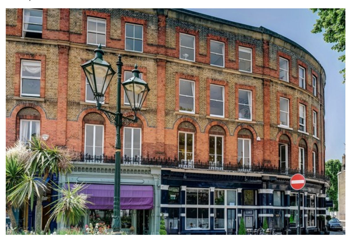
The Michelin-starred Launceston Place is a 1,345-square-foot, three bedroom apartment on the market for $4.1 million.

By RUTH BLOOMFIELD March 6, 2014 6:19 p.m. ET