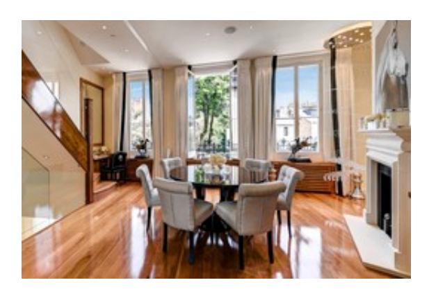
Inside the three-bedroom apartment listed for $4.1 million.

All that has changed. These properties are now worth as much—and in some cases a little more—than traditional apartments.